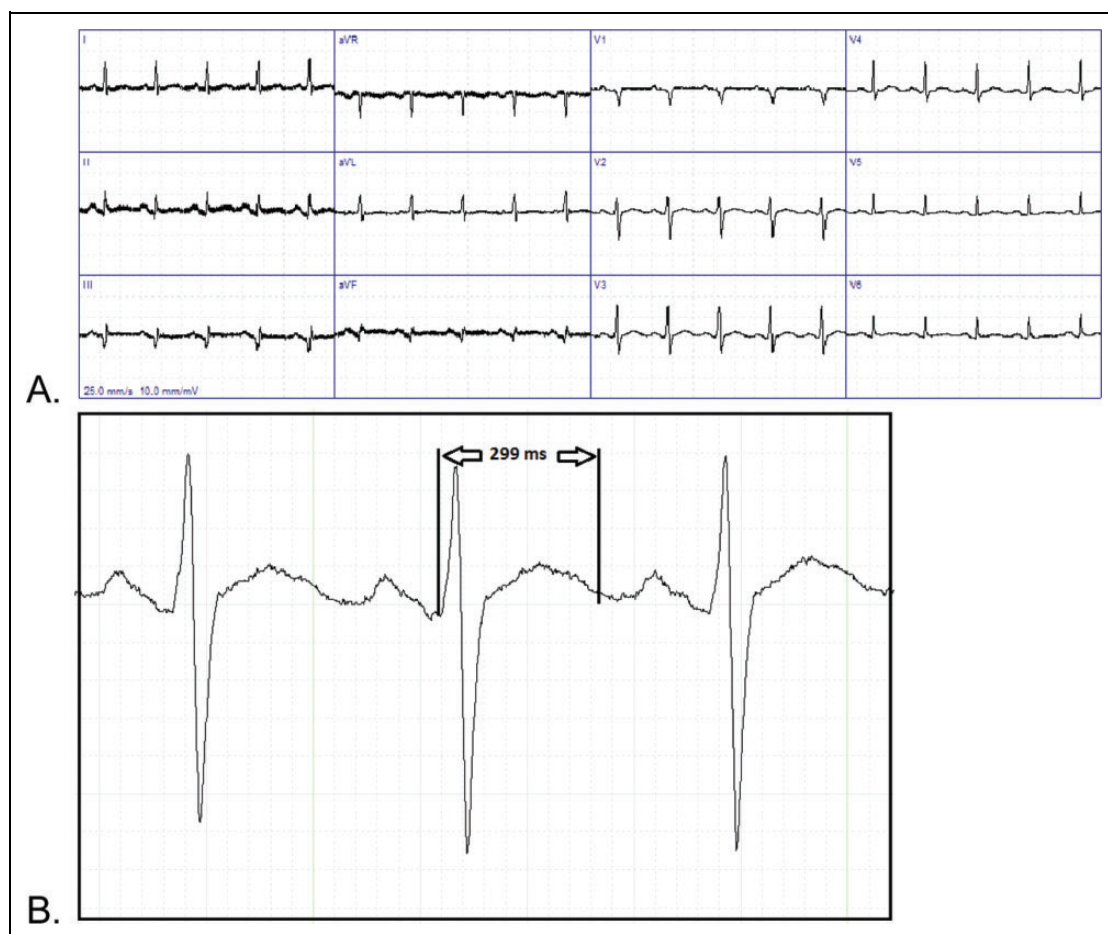
Figure 1. Electrocardiogram (ECG) machine-measured QT 512 milliseconds; QTcF 644 milliseconds; centrally measured QT 299 milliseconds; QTcF 376 milliseconds. (A) Full 12-lead ECG. (B) Magnification of lead V5.