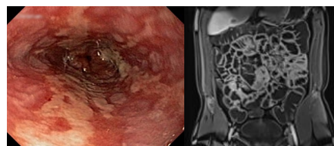
Erosive esophagitis 2